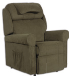
MAJESTIC THISTLE GREEN