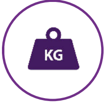
180kg Safe Working Load