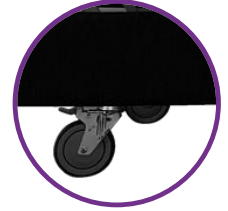
Heavy Duty Castors