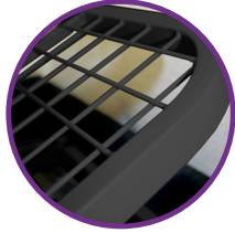
Strong Breathable Mattress Platform