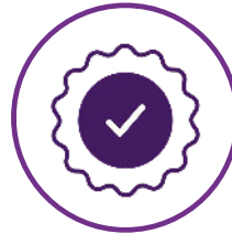
5 Year Warranty