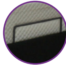
End and Corner Mattress Retainer Bars