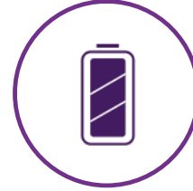
External Rechargeable Battery Back-up