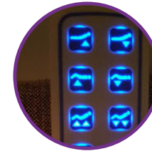
Back Lit Wipeable Hand Piece