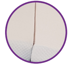
No gap between partner mattresses