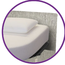
Available with Headboards & Footboards