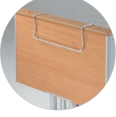
PUMP BRACKET CM - ACC15