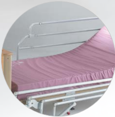
FOLDING SAFETY SIDES Steel extra height folding safety sides (pair) CM-ACC07.52