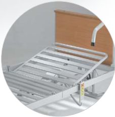
MOBILITY SUPPORT HANDLE CM - ACC11 Left handed CM - ACC12 Right handed