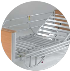
FOLDING SAFETY SIDES Steel folding safety sides (pair) CM-ACC06.52