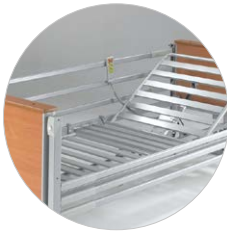
STEEL SAFETY SIDES Full length steel safety sides (pair) CM-ACC04.52