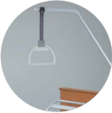
LIFTING POLE CM - ACC09 Single position