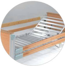
WOODEN SAFETY SIDES Full length wooden safety sides (pair) CM-ACC00.52

This model is not to be used within the domestic homecare environment.