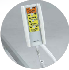
FLEXIBLE HANDSET HOLDER CM - ACC13